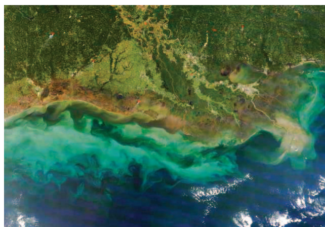
Figure 2. The moderate-resolution imaging spectroradiometer (MODIS) on NASA's Terra satellite captured this image on September 26, 2008, 13 days after Hurricane Ike came ashore. The brown areas in the image are the result of a massive storm surge that Ike pushed far inland over Texas and Louisiana, causing a major marsh dieback.

storm's surge. The powerful tug of water returning to the Gulf also stripped marsh vegetation and soil off the land. Therefore, some of the brown seen in the wetlands may be deposited sediment. Plumes of brown water are visible as sediment-laden water drains from rivers and the coast in general. The muddy water slowly diffuses, turning pale green, green, and finally blue as it blends with clearer Gulf water (NASA/GSFC, 2010; Ramsey and Ragoonwala, 2005).