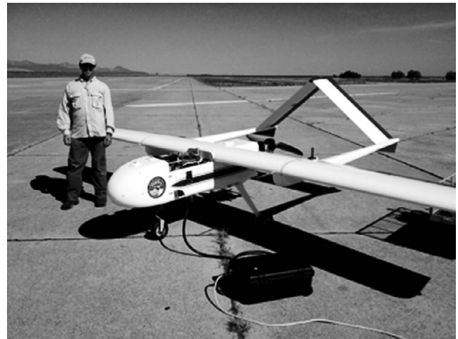
Figure 1. The Sensor Integrated Environmental Remote Research Aircraft (SIERRA) on the tarmac at NASA's Crows Landing Airport in California. Credits: Oleson and Glen (2013).

These SUAVs have advanced designs to carry small payloads and integrated flight control systems, giving them semiautonomous or fully autonomous flight capabilities. In autonomous UAVs, the acquisition of remote-sensing data is preprogrammed with flight planning software that can calculate waypoints for image acquisition based on the desired ground resolution, amount of image overlap, and area to be surveyed. Digital cameras are commonly part of the payload. During the flight, the UAV's autopilot can communicate via a telemetry link to a ground station running flight control software (Hugenholtz, 2012). For example, the AeroVironment RQ-14A "Dragon Eye" has a 110-cm wingspan and weighs about 2.5 kg. Launched by hand or with a bungee cord, the small plane is controlled by GPS coordinates entered into its guidance system with a standard laptop computer. Once aloft, it can transmit video images of the coastal landscape in real time (Edwards, 2009).