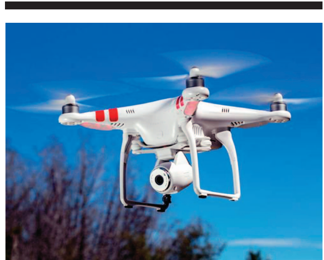
Figure 2. DJI Phantom 2 Vision Quadcopter with integrated camera.

Unmanned helicopters come in many different configurations. One popular, stable design is the quadcopter, a multi-rotor helicopter that is lifted and propelled by four rotors. Quadcopters use two sets of identical fixed-pitch propellers: two rotating clockwise and two counterclockwise. Control of