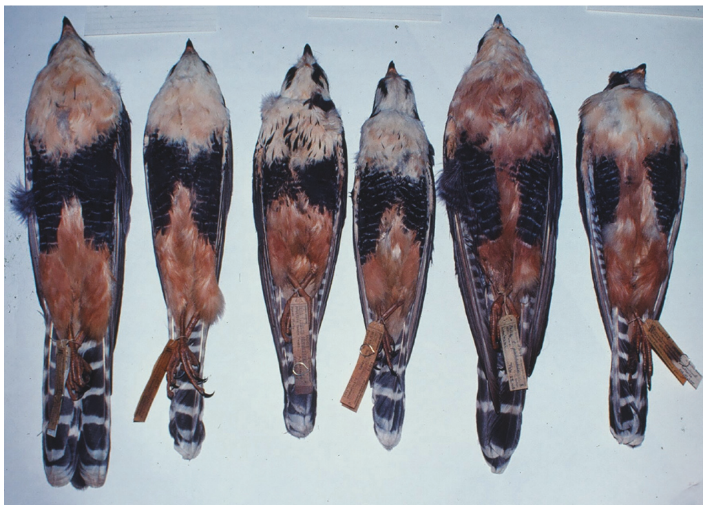
Figure 1. Female and male specimens of Aplomado Falcon subspecies, from left to right: F. f. septentrionalis , F. f. femoralis and F. f. pichinchae

Hellmayr & Conover and emphasised the larger size (than the nominate form), incomplete abdominal band, and darker, more intense coloration.