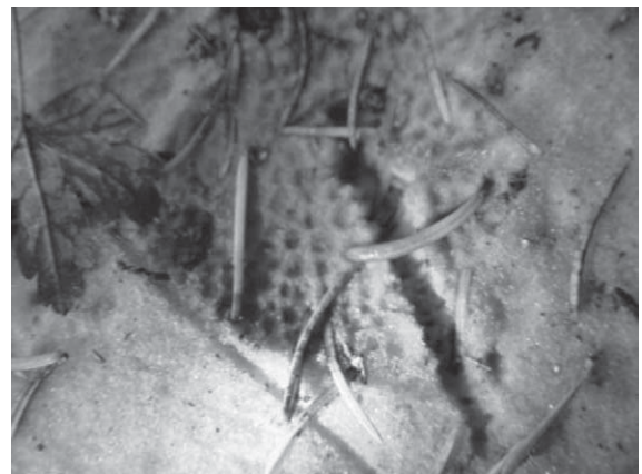
Figure 2. An impression of metacarpal dimpling from a porcupine captured by the foam track plate during field trials.

In a separate test, running water from a tap on the foam plate for 10 minutes had no obvious affect on the plate or dog tracks imprinted in the plate. Furthermore, the wetted foam plate maintained its ability to register further impressions. Freezing the