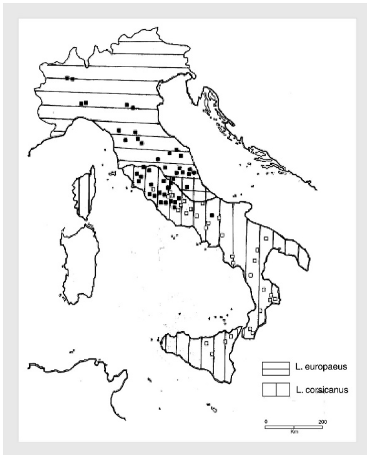
Figure 1. Hypothetical reconstruction of the original ranges of Lepus europaeus and L. corsicanus , and specific capture localities of L. europaeus (■) and L. corsicanus (□). The actual distribution of L. europaeus in Italy is affected by the hunting restocking, i.e. introduction also into areas from which the species was originally absent.

corded the following measures: body mass to the nearest 0.1 kg (measured by a REBÜRE, Germany, 0-25 Kg dynamometer, calculated before the entrails), body, head, tail, hindfoot and ear length (using a precision calliper; all to the nearest 0.1 cm). Body mass was measured only in males and non-pregnant females.