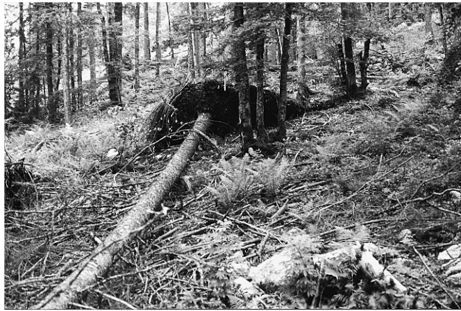
Figure 3. Maternal den site of female F21 in 1992 placed in the root stock of an overthrown tree; a rather atypical den site, lying in flat terrain (15°), providing little shelter and being easily accessible. Nevertheless it represents a maternal den site fairly well, since there were several hiding places around it.

ed once. However, the fact that a female chose the same den site again may indicate that this was a particularly ideal site. Furthermore, we examined whether daughters chose similar denning sites as their mothers, but did not find any concordance.