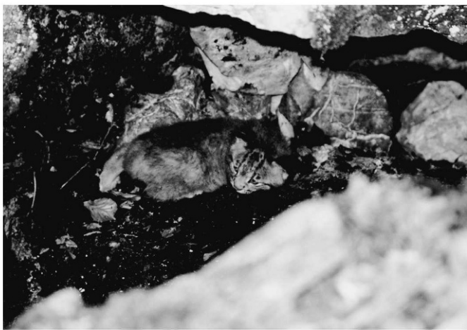
Figure 2. Natal den in a rock cleft (showing a kitten of female F34 in 2000). This is a rather typical situation since 65% of the dens were made of rock.

To avoid pseudo-replication, two dens, which were used by two females in two consecutive years, were considered only once for the analyses of microstructure and parameters describing the immediate surroundings. Two more sites were considered only once for the analyses of the topographic and strategic situation, because the females had used immediately neighbouring dens in consecutive years. Furthermore, for some den sites, we knew the location (because the female was repeatedly located at this place), but not the actual site (because the female had moved the litter before we could visit it). This leaves us with a basic sample size (see Table 1) of 42 for the microstructure and 66 for the macrostructure analyses. To test whether females had chosen consecutive dens according to individual preferences for specific den sites or habitat structures, we compared the different dens of the single females among themselves before running the subsequent analyses. We did not detect any particular preferences, except for the above-mentioned four pairs of identical dens/sites, which were exclud-