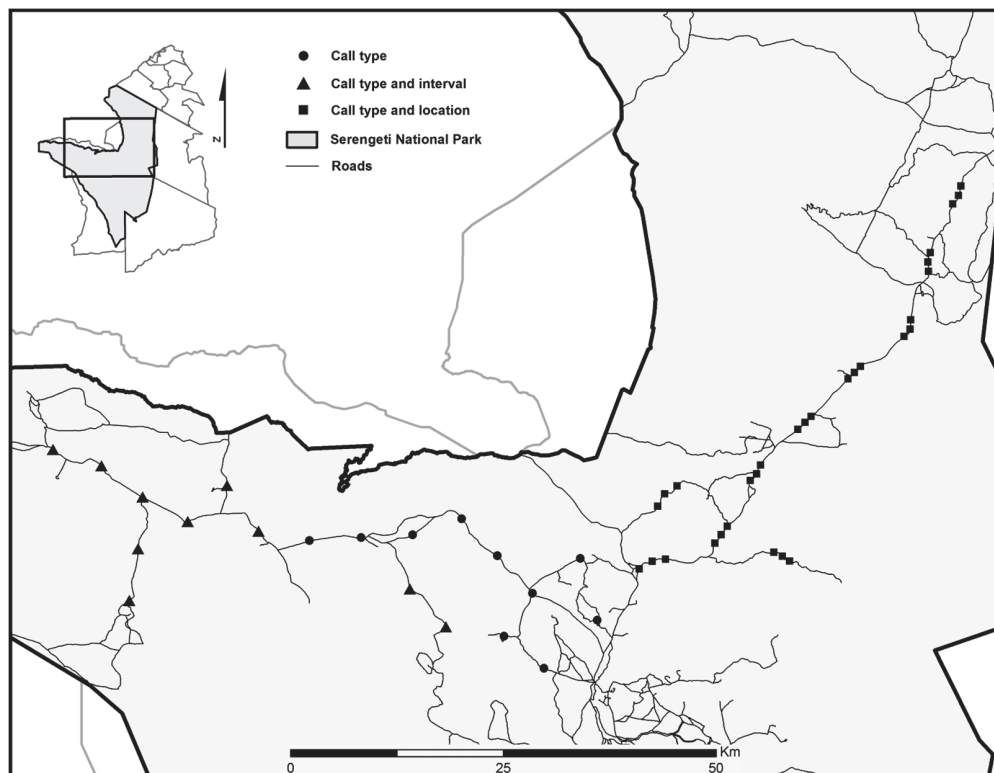
Figure 1. Sites used to elicit lion approach using broadcasted vocalizations, Serengeti National Park, Tanzania, February–April 2016.

Call-in procedures generally followed Belant et al. (2016). We broadcasted vocalizations at each site for 70 min, playing calls for 10 min, followed by a 5-min pause, and then repeated this pattern five times. Each 10-min broadcast started with 40–60 s of a single female lion, followed by 80–100 s of prey, and 40 s of a spotted hyena; this sequence was repeated three times. We broadcasted calls with maximum intensity of 110 dB using a commercial game calling system (Foxpro Inc., Lewistown, Pennsylvania, USA). We