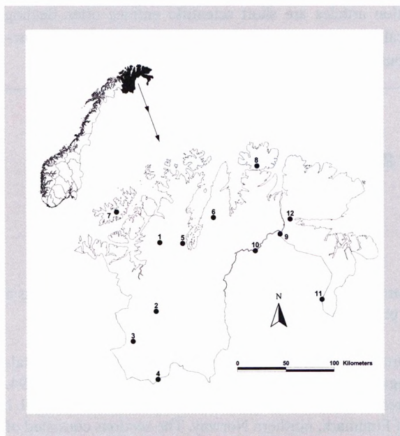
Figure 1. Location of the 12 reindeer fence sections in the county of Finnmark, northern Norway, which were patrolled during 1991-1994 to assess the extent of bird collisions.