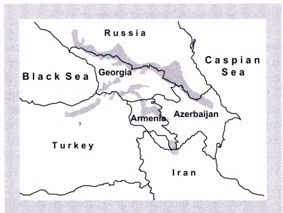
Figure 1. Distribution of the Caucasian black grouse (after Storch 2000).

The Caucasian black grouse is the only grouse species represented in Turkey. According to recent liter-