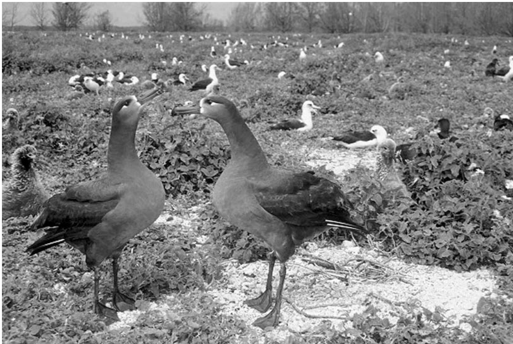
FIGURE 3. A field of Verbesina encelioides (golden crownbeard) on Eastern Island (Midway Atoll, Hawai'i) with a pair of black-footed albatross dancing in front of some Laysan albatross.

similar results comprised were found. In 1991, V. encelioides stands composed 18.2 ha, and in 2004 they comprised 60.0 ha—an increase of 230% (Laniawe 2004a). Very few areas were found where native species co-dominated the habitat with V. encelioides (Laniawe 2004a).