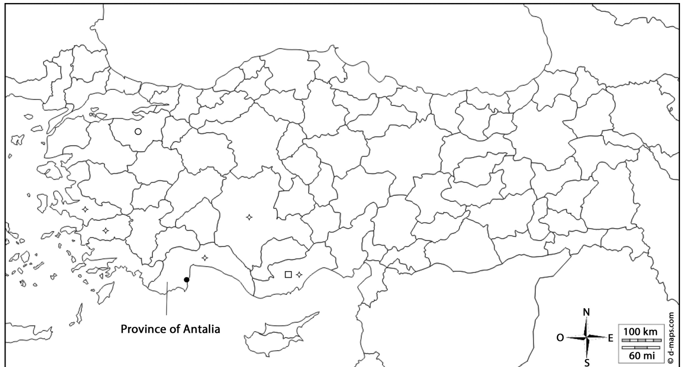
Fig. 4: Geographical location of Philodromus musteri spec. nov., locus typicus (●) and location by province of three other species of the Philodromus aureolus group: P. bonneti (○), P. buchari (□), P. lunatus (◇), based on Demir (2008) and Logunov & Kunt (2010)

Philodromus bonneti Karol, 1968 is a reportedly endemic species known so far only from northwest Turkey (Bursa) and only from the male. It was described by Karol (1968) as belonging to the Philodromus aureolus group and recognized as such by Muster & Thaler (2004), but could not be traced at the Paris museum. The authors state that this species resembles P. lunatus with respect to characters of the male palpal organ. However, several details actually suggest that some structures have been schematized in the figures, i.e. simple, conical shape of several apophyses (RTA, ITA), unfigured descending part of sperm duct loop, schematic conductor contour and the unfigured intertegular reticulum, at least in retrolateral view.