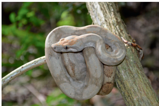
Figure 3. Boa imperator from Cayos Cochinos, Honduras.

Conservation Status. This taxon has not received an IUCN Red List assessment; it is, however, listed under CITES Appendix I