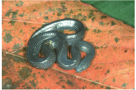
Figure 12. Exiliboa placata from Oaxaca, Mexico.

Taxonomy. Described as the type species ( E. placata ) in a new genus ( Exiliboa ) by Bogert (1968b). No subspecies are recognized.