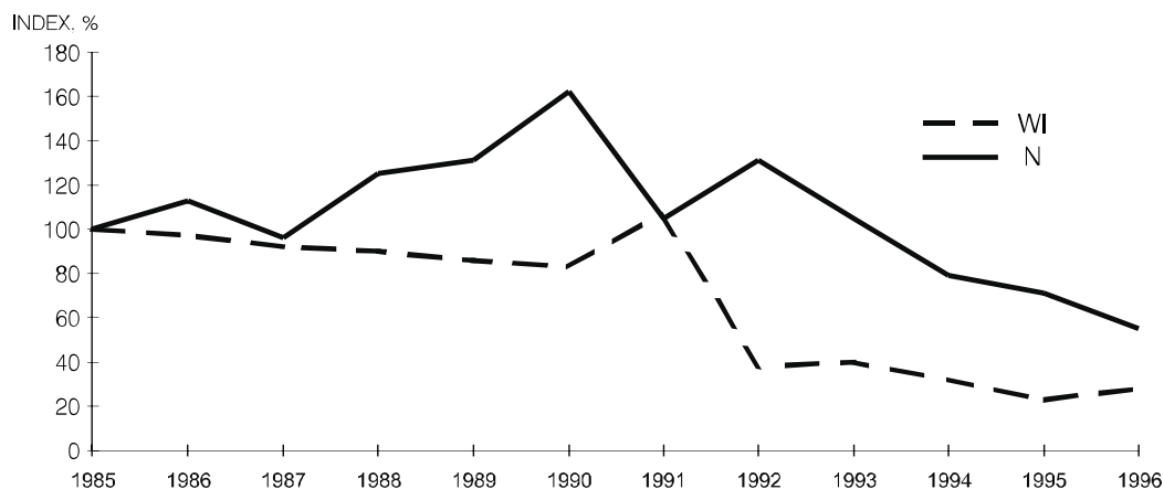
Fig. 2. Dynamics of wintering Mallard population (N) computed to welfare index (WI).

12) but no correlation was found for the Moscow-river ( r_s = -0.17 , ns) and the whole city ( r_s = 0.38 , ns). Unfortunately no data was available to calculate WI-values for the years 1997–1999.