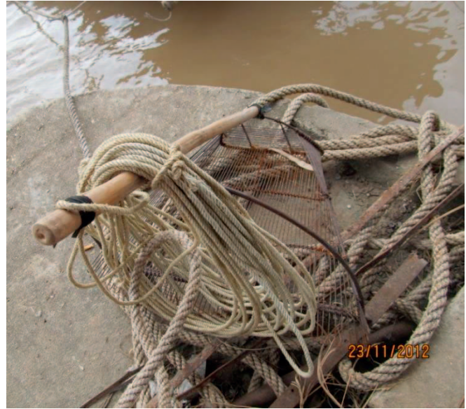
Figure 3. Small clam rake used by local fishermen to collect freshwater mussels from the local rivers. Photograph by Van Tu Do. Ca Lo River, Soc Son District, Ha Noi, Vietnam. Photograph by Van Tu Do. November 23, 2012.

Hyriopsis bialatus was listed from Malaysia, Thailand, Cambodia, southern Vietnam, and Tonkin (Brandt 1974) and recently confirmed from the Mekong Delta in Vietnam by Bogan and Do (2014b). However, Hyriopsis bialatus has been shown to be three separate species based on mitochondrial DNA sequence data with H. bialatus being described from the “in Songi flumine Malacca” (Sungi River, Malacca, Malaysia) (Zieritz et al. 2016, 2017). Sungi is the Malay