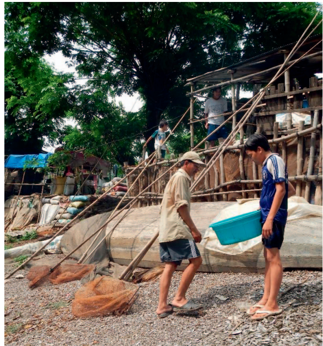
Figure 4. Long-handled rake with basket from southern Vietnam. April 4, 2014.

word for river, so the locality is unclear and Malacca referred to the southern side of peninsular Malaysia. An available name for the species occurring in the Mekong River basin is Hyriopsis gracilis Haas, 1910 (Haas 1910b). We are using H.