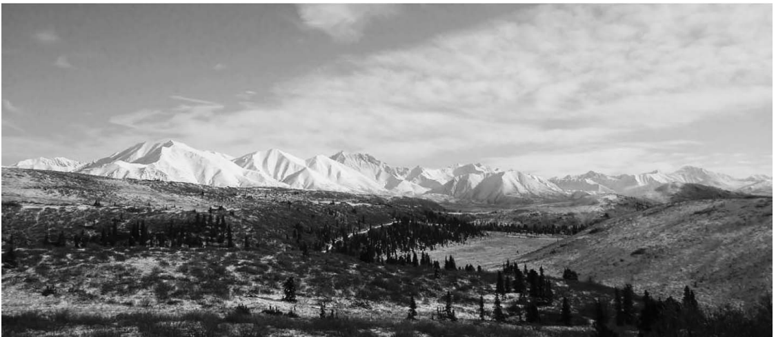
Figure 3. View looking to the northwest (top) and northeast (bottom) from an autumn observation site near Lost Creek on the southern slopes of the Mentasta Mountains, October 2014. In autumn, most Golden Eagles were detected as they migrated along the higher ridges of the Mentasta Mountains to the north of the observation site.

low along slopes or circling low over the landscape) and 91 appeared to be primarily intent on migrating. We did not observe any white feathering on most of the eagles we detected in spring 2014.