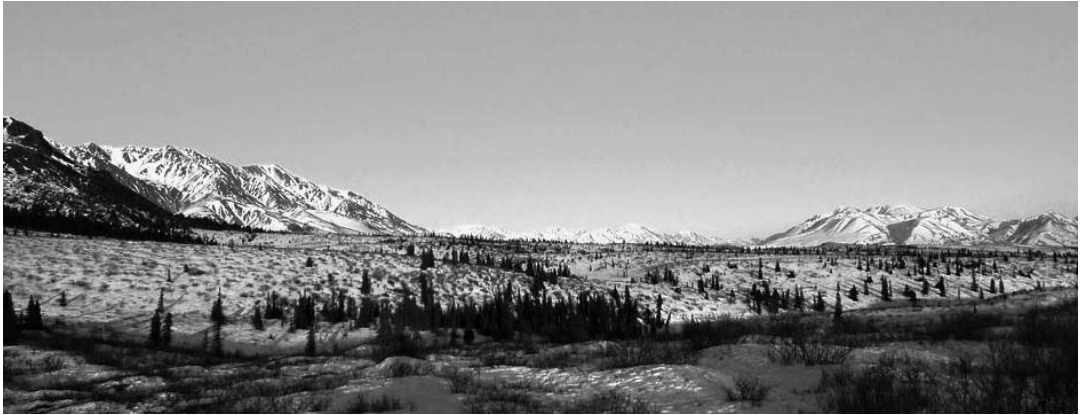
Figure 2. View looking east from a spring observation site near Rock Creek on the southern slope of the Mentasta Mountains, March 2014. In spring, migrating Golden Eagles were detected across a broad front, from the Mentasta Mountains to the north (left side of photo) to the Boyden Hills to the south (right side of photo).

capture work (5 d from an east-facing blind, 17–21 March, and 5 d from a west-facing blind, 23–27 March), and while we dismantled our field camp and trapping sites (1 d; 28 March).