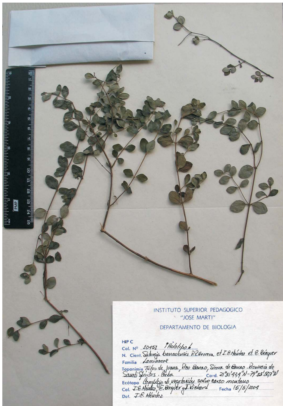
Fig. 1. Satureja banaoensis – holotype.