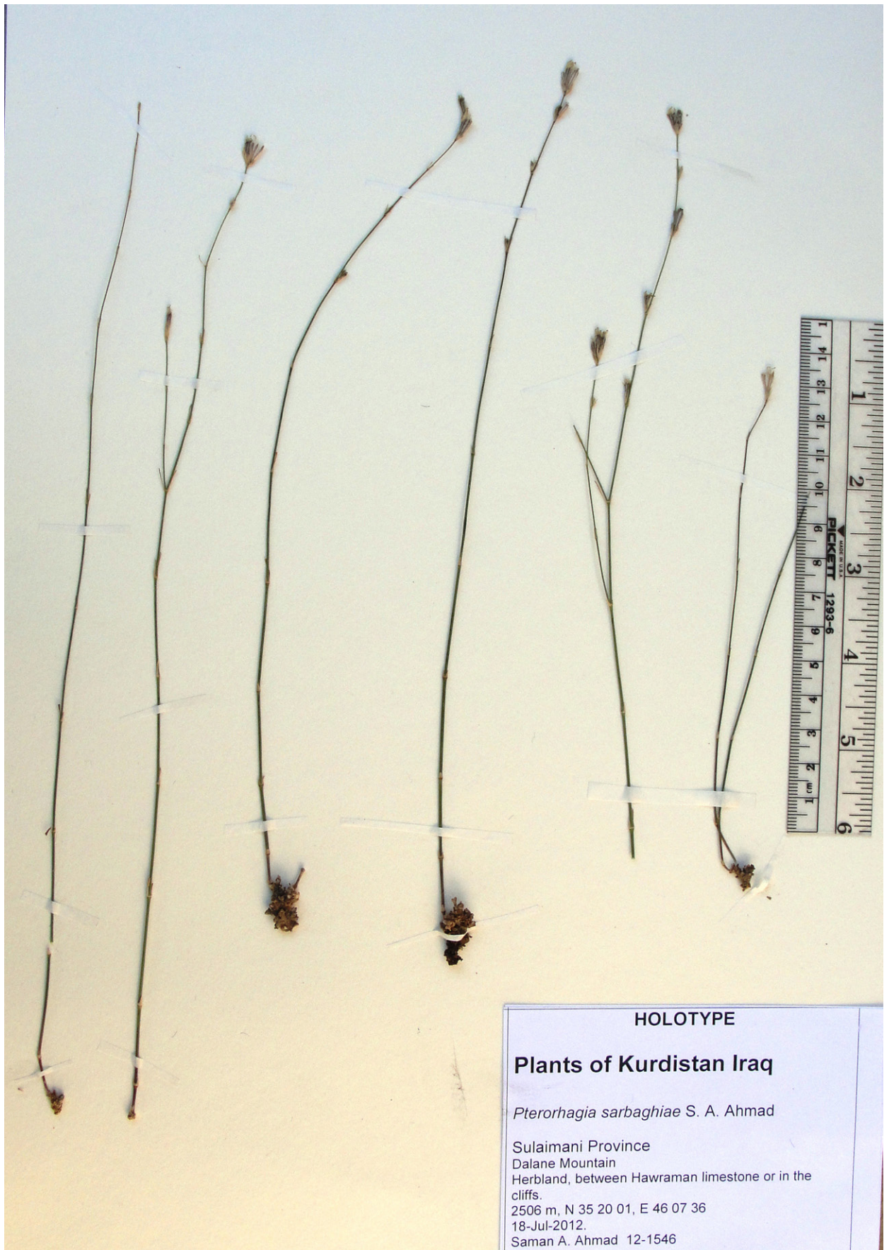
Fig. 1. Petrorhagia sarbaghia – photograph of the holotype specimen at SUFA.