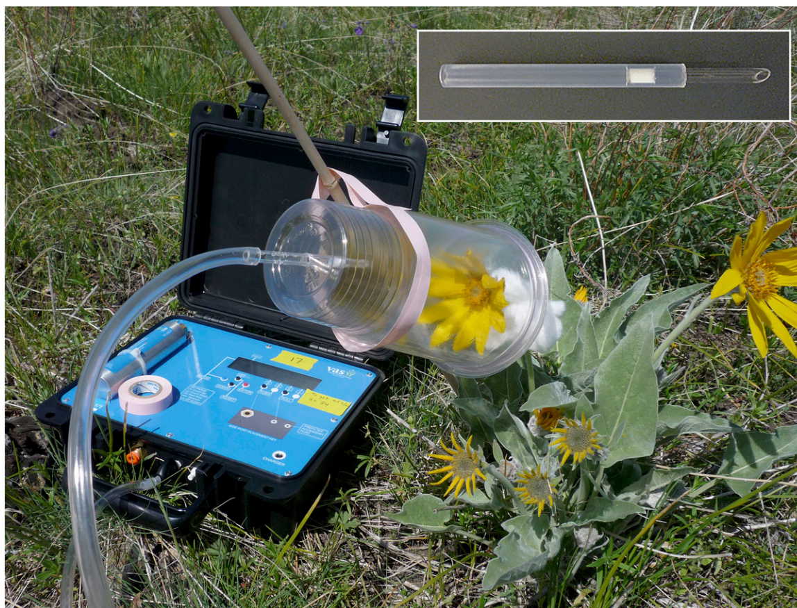
Fig. 2. Collecting VOCs from flowers of arrowleaf balsamroot ( Balsamorhiza sagittata (Pursh) Nutt.) in the field. This setup is being used by the authors to study the effects of environmental change on floral scent and pollinator attraction. The inset shows a volatile collection trap containing a bed of the adsorbent HayeSep Q. Details of this setup are provided in Appendix 1.