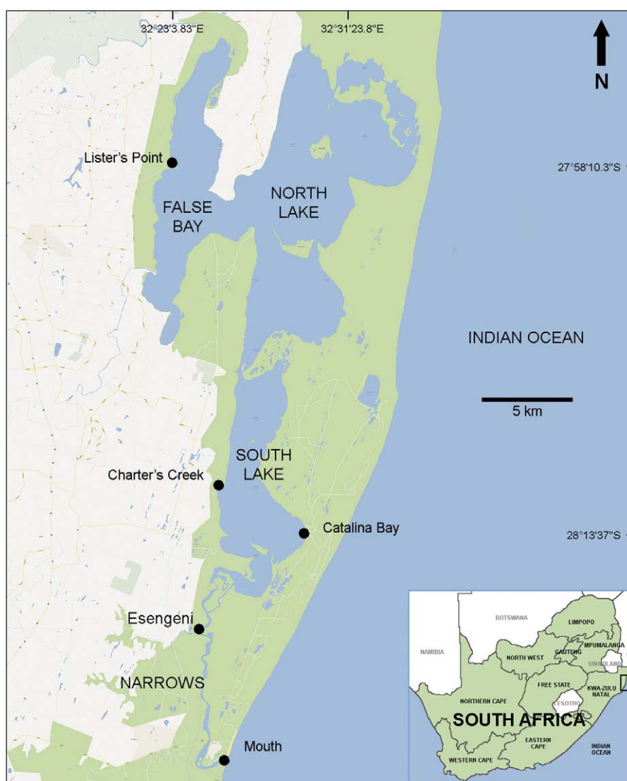
Fig. 2. Map of the St Lucia estuarine lake, showing the main basins and stations within the system.

and South Lake), which are generally connected to the Indian Ocean through a narrow, long channel known as the 'Narrows'. The estuarine lake is susceptible to periodic large-scale fluctuations in physico-chemical characteristics due to stochastic flood and drought events, and has recently experienced a prolonged period of virtually uninterrupted mouth closure since 2002 (Whitfield & Taylor 2009; Cyrus et al. 2011).