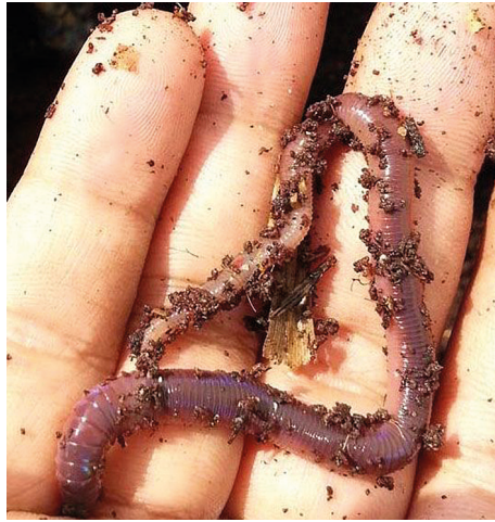
Fig. 1. A Eudrilus eugeniae specimen from a vermicompost site.