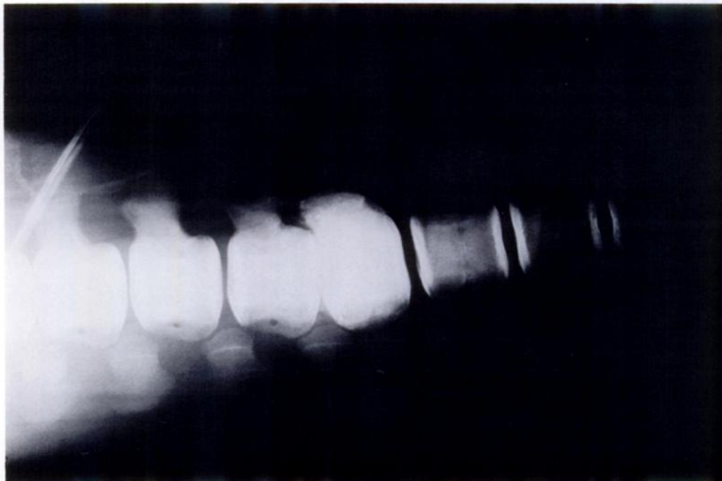
FIGURE 3. Radiograph of the posterior lumbar spine of an Atlantic bottlenose dolphin 4 mo posttreatment. Although the disk space has remained collapsed there has been no further extension of the disease process as compared to Figure 2.