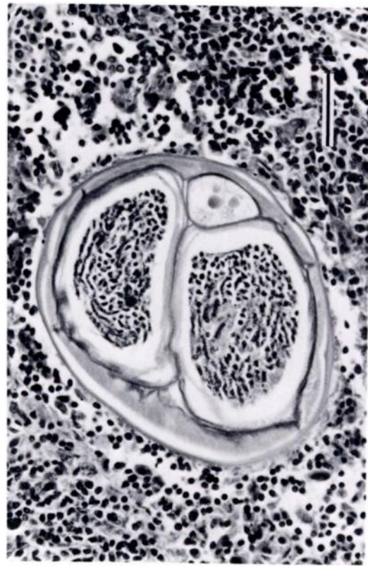
FIGURE 2. Gravid female filarioid nematode (?Lemdaninae) within hypodermal lymphoid tissue of a platypus (Animal two). H&E. Bar = 50 \mu m.

(Spratt and Whittington, 1989). The largest fragment was 2.30 mm long and 0.18 mm wide. A similar gravid female filarioid has since been recovered from a platypus from Georges River, St. Helens, Tasmania (Spratt, unpubl.) (W/L N3041, P109). A fragment of this nematode recovered from subcutaneous tissue was 11.40 mm long. Cross sections in histological sections were 103 to 152 \mu m in diameter and were not associated with host reaction. Male and female specimens of another filarioid, Cercopithifilaria johnstoni , a parasite known from a range of eutherian and marsupial hosts in eastern Australia (Spratt and Haycock, 1988), have recently been recovered from platypuses in Tasmania, but are dis-