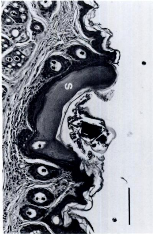
FIGURE 3. Trombiculid mite lying on the epidermis of a platypus (Animal one). Note the amorphous eosinophilic gel saliva (S). H&E. Bar = 100 \mu m.