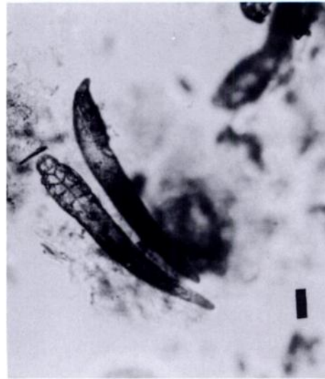
FIGURE 2. Whole mount Demodex sp. in skin scraping from ground squirrel ear canal. Bar = 28.4 \mu m.

Demodex spp. have been described in a wide variety of wild and domestic mammals as well as in humans (Nutting, 1964). They inhabit hair follicles and adnexal glands in numerous locations on the bodies of their hosts. These mites are generally species specific; however, several species of Demodex may parasitize the same host. In such cases, each species is restricted to a particular habitat. An example of this is human infection with D. folliculorum , which lives in the hair follicles of the face, and D. brevis , which inhabits the sebaceous glands (Bowman, 1995). Demodex spp. are believed to be transmitted between hosts by direct contact and usually do not cause clinical signs of disease. In some species, such as dogs infected with Demodex canis , De-