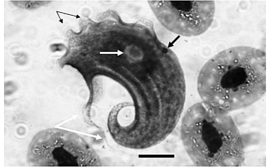
FIGURE 2. Trypomastigote of Trypanosoma sp. from Rana pretiosa . Single white arrow = nucleus; single black arrow = kinetoplast; paired black arrows = undulating membrane; paired white arrows = free flagellum. Bar=10 \mu .

( R. pretiosa ) during mark-and-recapture projects at three sites in Deschutes County, Oregon (Sunriver, NAD 27, UTM Zone 10, 624632 E, 4860501 N; Crosswater, 624358 E, 4856498 N; and Dilman Meadow, 607464 E, 4839143 N). Animals were toe-clipped and blood was applied directly to a glass microscope slide; a thin film was made using the trailing edge of a second glass slide. All frogs appeared normal and healthy and were released at the site of capture.