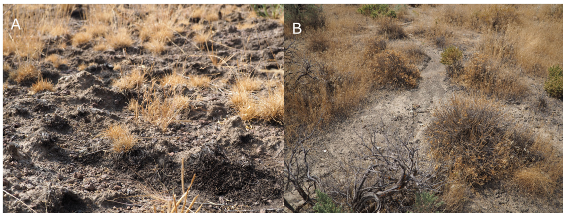
Figure 3. A, Pedestaled bunchgrasses indicating water and/or wind erosion. B, Water flow patterns indicating overland flow.

are useful for building understanding of resource issues and developing shared stewardship goals. 20 A shared understanding of resource issues and vision for the future can lead to identifying more effective management solutions and inspire commitment to implementing those solutions over the long term. 21