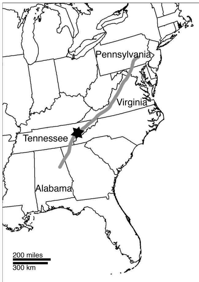
Figure 1. Map of eastern U.S.A. showing trend of Ediacaran to lower Cambrian Chilhowee Group (gray shading) in southern and central Appalachians. Star symbol indicates location of Chilhowee Mountain, Blount County, Tennessee, where the fossils discussed herein were collected.

(e.g., Walcott, 1910; stratigraphic divisions for the Cambrian of Laurentia follow Palmer, 1998). However, subsequent systematic revisions have greatly restricted the inclusivity of the genus (e.g., Palmer and Repina, 1993; Palmer and Repina in Whittington et al., 1997; Lieberman, 1998, 1999). With the recent reassignment of many species of “ Olenellus ” sensu lato to other genera, occurrences of Olenellus sensu stricto are apparently restricted to the mid- and upper Dyeran (provisional Cambrian Stage 4; Peng et al., 2012) (Webster, 2011 and references therein; Webster and Bohach, 2014). The historical records of “ Olenellus ” within the Chilhowee Group must, therefore, be re-evaluated in light of modern systematics in order to exploit their full biostratigraphic potential. Unfortunately, re-evaluation of the Murray Shale record is hampered by: (1) the absence of any description or illustration of specimens; and (2) the failure of subsequent workers to collect any additional trilobite material, despite concerted efforts. The lack of success is due in part to poor and confusing descriptions of field localities (see below) and the apparent rarity of specimens. Indeed, several workers have expressed doubt regarding the supposed stratigraphic provenance of the material reported by Walcott and Keith (see below).