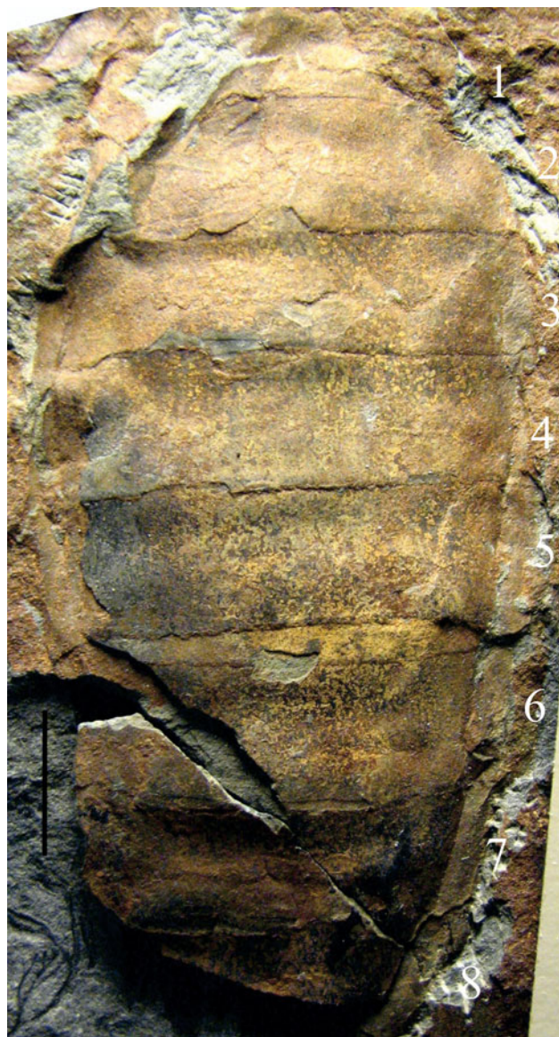
Figure 2. Stylonurina incertae sedis. Price Formation, Lower Mississippian, Pond Lick Hollow Road near Pulaski, Virginia. NCUPC 135A. Segments numbered 1–8. Scale 10 mm.

bambachi n. sp. is therefore unique among known Cyrtocetus species in broadening distally and having a rounded termination. The lack of crenulations on the appendage podomere distal margins is also unique among Cyrtocetus species.