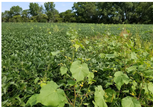
Figure 1. Velvetleaf escape after dicamba applied POST in dicamba/glyphosate-resistant soybean in south central Nebraska.

biennial, and 65 perennial broadleaf weeds (Anonymous 2020). Growers rely on dicamba for POST broadleaf weed control, including control of glyphosate-resistant Palmer amaranth ( Amaranthus palmeri S. Watson) in DGR soybean (De Sanctis et al. 2021); however, velvetleaf escape has been observed where dicamba was the only herbicide applied POST (Figure 1). Murphy and Lindquist (2002) reported poor control of velvetleaf with dicamba at 318 g ae ha -1 under field conditions. Hart (1997) reported 87% velvetleaf biomass reduction with dicamba at 140 g ae ha -1 + halosulfuron-methyl at 9 g ai ha -1 . Herbicide efficacy can be affected by velvetleaf plant height. Knezevic et al. (2009) reported 84% and 68% velvetleaf control with glyphosate at 1,059 g ae ha -1 when plants were 12 cm and 25 cm tall, respectively, at the time of glyphosate application. Ganie and Jhala (2021) reported velvetleaf density of 1 plant m -2 with glyphosate at 1,060 g ae ha -1 applied to 8- to 12-cm-tall plants compared with 7 plants m -2 in the nontreated control.