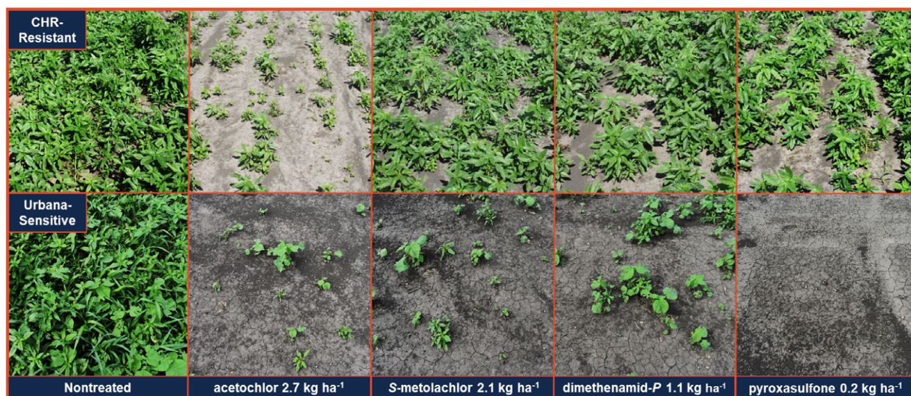
Figure 2. Representative images of very-long-chain fatty acid (VLCFA)-inhibiting herbicide efficacy for control of VLCFA inhibitor-resistant waterhemp population (CHR) and a sensitive (Urbana) population, 28 d after treatment.

biomass 42 DAT compared with the nontreated. Nontreated biomass averaged 102 \text{ g m}^{-2} , and biomass reduction ranged from 79% to 99% across treatments. Non-encapsulated acetochlor and pyroxasulfone reduced waterhemp biomass by 98% to 99%.