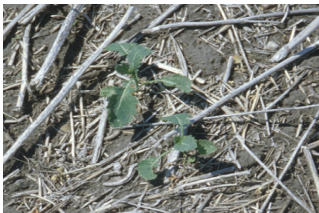
Figure 1. Glyphosate- and glufosinate-resistant canola volunteers in adjacent fields in Saskatchewan, Canada, due to bidirectional pollen-mediated gene flow the previous year.

(e.g., drought, salinity) have potential for greater weediness, persistence, and invasiveness in ruderal areas (Beckie et al. 2010).