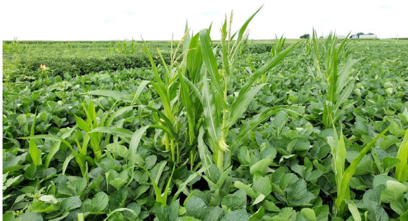
Figure 2. Soybean after corn is a typical rotation in the midwestern United States. If not controlled, volunteer corn is a problem weed in soybean fields.