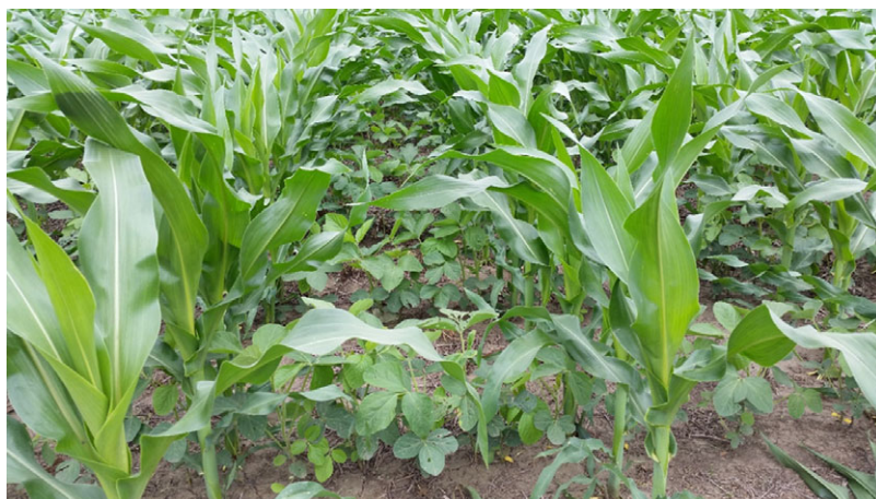
Figure 8. Volunteer soybean in a cornfield in Nebraska.

2009 (Fernandez-Cornejo et al. 2016) and 98.5% in 2013 (ISAAA 2014).