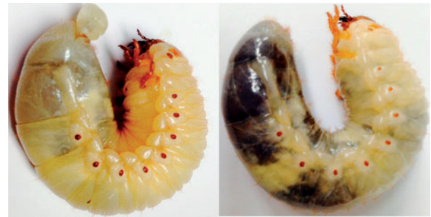
Fig. 1. Comparison of a diseased larva with viral infection (left) and a healthy larva (right). Diseased larva appears beige and milky, and its rectum is prolapsed. The abdomen of the diseased larva swells up, and the body is very soft.

The viral DNA fragment amplified by AdV-F1/R1, -F2/R2, and -F3/R3 was isolated from agarose gel, and DNA sequences were determined with an Applied Biosystems 3730xl DNA Analyzer (MacroGen, Seoul, Korea). Blast search with OrNV genome (NC_011588) revealed that the three sequences have 98%, 98%, and 99% identical to corresponding OrNV genes, respectively.