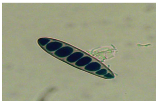
Fig. 3. Macroconidia of Trichophyton ajelloi stained with lactophenol blue and visualized using a compound microscope, 1,000× magnification.

An intriguing alternative reason for our inability to recover T. verrucosum could be a result of competitive interference among fungi in our laboratory cultures (Shearer 1995). Penicillium spp. (Fig. 2C) represented 3.4% of cfus recovered in the current study, and they produce the antifungal compound, griseofulvin, which has been used to treat dermatophytoses caused by Microsporum spp. and Trichophyton spp. (El Nakeeb et al. 1965). For example, a macroconidia of Trichophyton was observed and photographed (Fig. 3), but it did not grow and develop into a colony and therefore could not be sequenced. Based on microscopy, this macroconidia appeared to be the common Trichophyton ajelloi , a geophilic fungus. In this instance, chemical antibiosis in our laboratory cultures may have impacted recovery. Further, bacterial-fungal community interactions may impact prevalence and recovery of