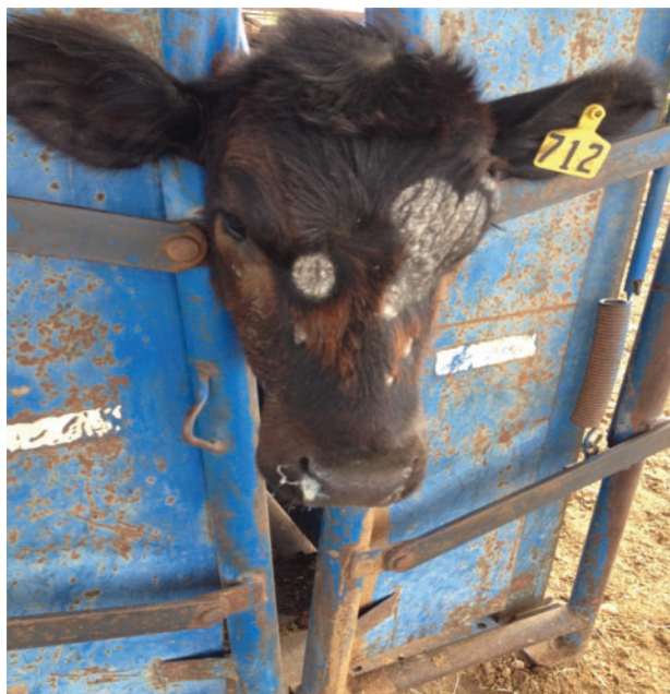
Fig. 1. Angus calf infected with bovine ringworm at the study site (Edinburg, TX).

Flies were collected on two separate occasions (05 June and 17 June 2014) from Angus cattle diagnosed with bovine ringworm. Cattle were stanchioned to ease fly collection using aerial nets to gather flies swarming around the faces of those infected. Flies were collected from one calf per collection date, with a total of two calves sampled. The flies that were collected were enumerated and individually stored (1 fly per 10 ml sterile vial) at -20^{\circ}\text{C} until processed. Two easily distinguished species were collected: house flies and horn flies, Haematobia irritans (L.), the latter of which were discarded.