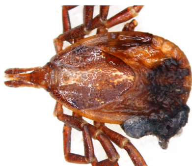
FIGURE 1. Dorsal view of adult A. longirostre female found in Oklahoma, note the elongated scutum.

On 24 September 2005, a homeowner discovered a large, odd looking tick crawling on a propane tank in Pittsburg County, south of Hartshorne, Oklahoma. The tick was collected, brought to the Pittsburg County Oklahoma Cooperative Extension Service office where it was sent by mail to the Plant Disease and Insect Diagnostic Lab (PDIDL) in the Department of Entomology and Plant Pathology at Oklahoma State University. The tick was identified on 3 October 2005 using an established key (Jones et al. 1972) (Figs 1, 2) as an adult female A. longirostre and given an ascension number (#200501316). It was later verified using detailed descriptions by Voltzit (2007).