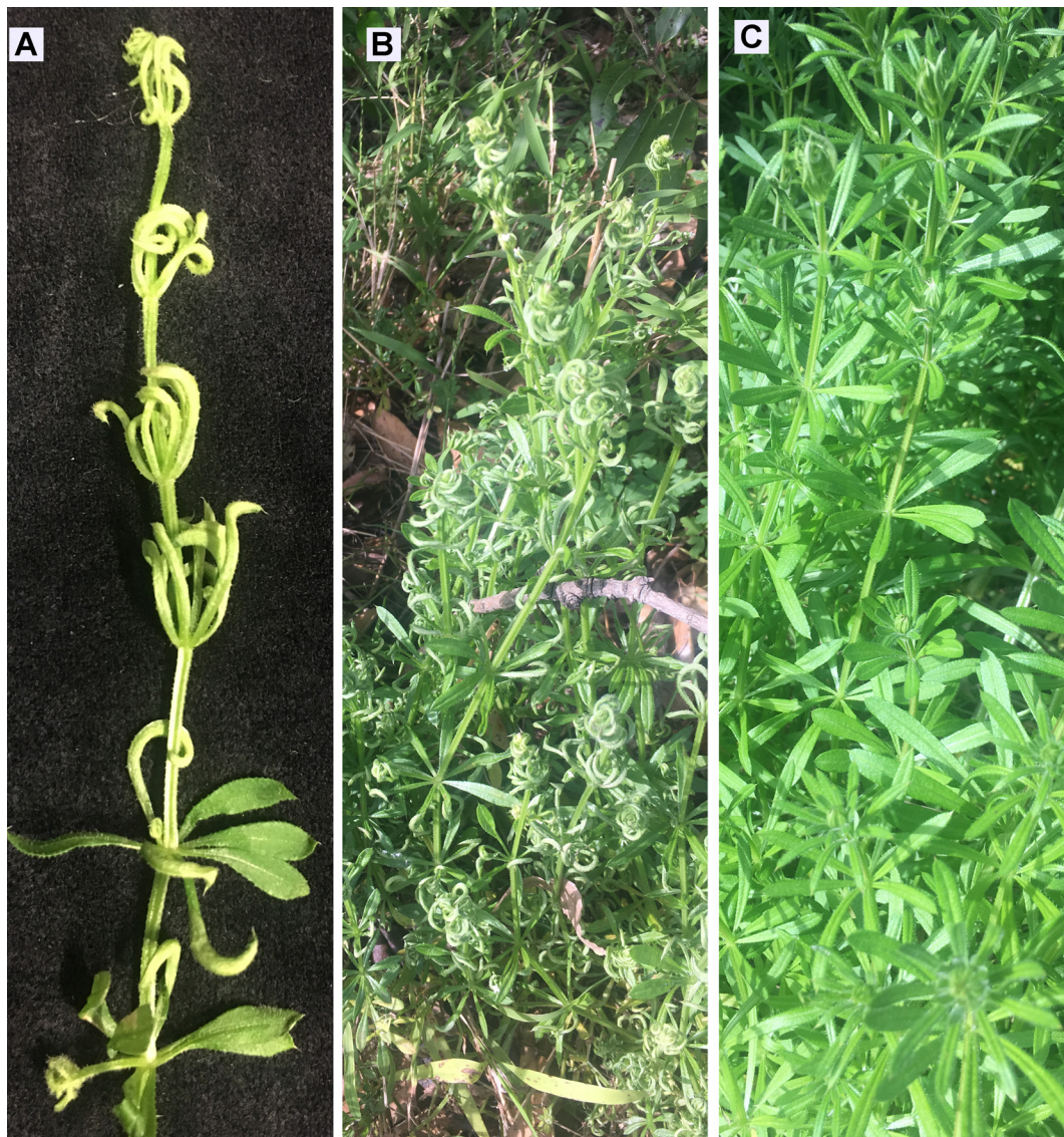
FIGURE 1. Cecidophyes rouhollahi and Galium aparine (St Johns, Auckland, New Zealand). A. Curled terminal leaves and expanded basal leaves of G. aparine (close-up view); B. Curled leaves of G. aparine in the field; C. Normal leaves of G. aparine .

predatory mites collected, we identified five species common in Auckland: Neoseiulus cucumeris (Oudemans, 1930); Amblyseius herbicolus (Chant, 1959); Amblydromalus limonicus (Garman & McGregor, 1956); Neoseiulella cottieri (Collyer, 1964); and Neoseiulella novaezealandiae (Collyer, 1964). No other phytophagous mites were observed on G. aparine . There seemed to be little doubt that the phytoseiids moved from other plants to this weed to take advantage of the super abundance of a new food source. Two of these phytoseiid species are important biocontrol agents and known to feed on eriophyids. Neoseiulus cucumeris could develop successfully on tomato russet mite, Aculops lycopersici (Massee), but failed to reproduce on this prey (Brodeur et al. 1997); whereas A. limonicus could feed and reproduce on a diet of this eriophyid mite (Houten et al. 2013).