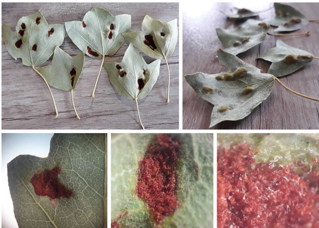
FIGURE 1. Symptoms observed on the leaves of Montpellier maple, caused by Aceria macrochela (Nalepa, 1891).

Making rounded galls with 2–4 mm diameter, with hard walls, often in angles between veins; inner surface of galls with many-celled hairs (Amrine and de Lillo unpublished database). During the current study, similar symptoms were found on the leaves of Montpellier maple, A. monspessulanum too (Fig. 1).