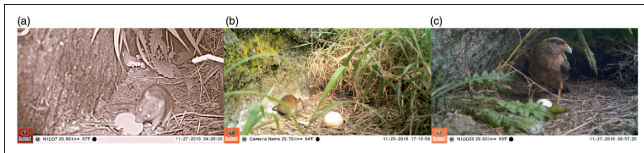
Figure 3. Potential predators recorded visiting simulated unattended eggs in nests of the red-tailed tropicbird, Phaethon rubricauda . (a) Brown rat Rattus norvegicus , (b) Polynesian rat Rattus exulans , and (c) Chimango Caracara Phalcoboenus chimango .