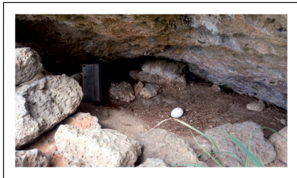
Figure 2. One of the empty red-tailed tropicbird nests at Rano Raraku used in this study showing an experimental egg and a Bushnell Camera Trap.

were empty but recently used as confirmed by the presence of feces, down, and feathers (personal observation). On November 20, 2016, three hen eggs of free-living birds raised at Rano Raraku were placed in three of the empty nests (one egg per nest). Each experimental egg was monitored by a Bushnell Camera Trap settled in each nest to record the visits and behavior of potential predators (Figure 2). The following day, nests were checked in the morning and evening to attempt to determine diurnal and nocturnal predators. None of the eggs were depredated. After each inspection, eggs and cameras were changed to other nests. On the second day, the same procedure was performed. Again, none of the eggs were depredated. Therefore, on the third day, eggs and cameras were