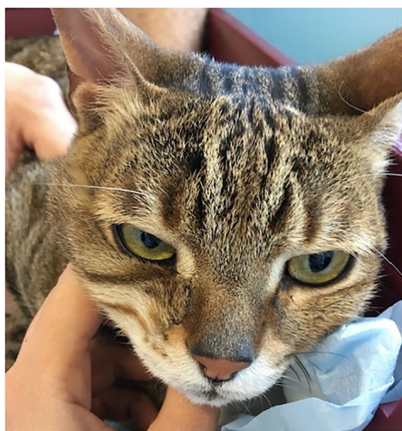
Figure 6 The patient at the time of follow-up, 170 days following surgery. The wound is healed and there is an acceptable cosmetic appearance. There are no signs of local tumour recurrence

Adjuvant doxorubicin was started 20 days after surgery. Three total treatments were administered every three weeks at a dose of 25 mg/m 2 as a slow IV infusion, following administration of maropitant at 1 mg/kg IV. Adjuvant chemotherapy was overall well tolerated: a sporadic, self-limiting VCOG grade I GI toxicity (nausea