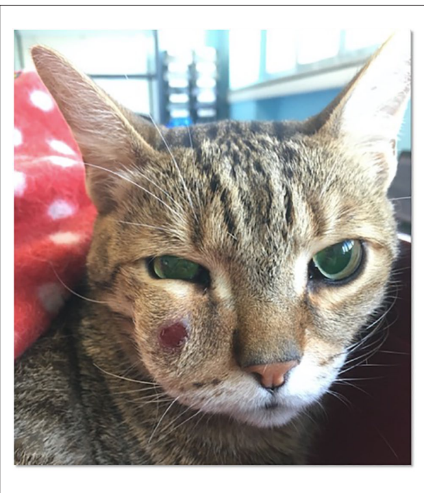
Figure 1 The patient at the time of presentation. The mass extends from the upper portion of the right lip towards the right ventral eyelid

Cytological findings were consistent with a mesenchymal neoplasia; therefore, a contrast-enhanced CT scan of the head, thorax and abdomen was performed for surgical planning and to rule out metastatic disease.