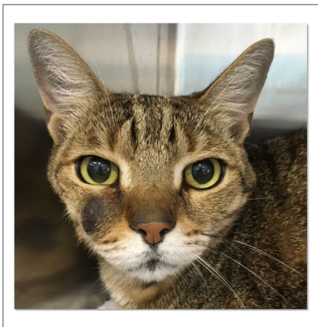
Figure 3 The patient after three treatments with doxorubicin. The mass has reduced by 39% of its original volume and there is a lesser extension towards the right eye and surrounding structures

sporadic, self-limiting gastrointestinal (GI) toxicity (nausea) was reported by the owner and no clinical signs of renal toxicosis or any haematological toxicity were detected. This was classified as grade I according to the Veterinary Co-operative Oncology Group (VCOG) Common Terminology Criteria for Adverse Events. 27