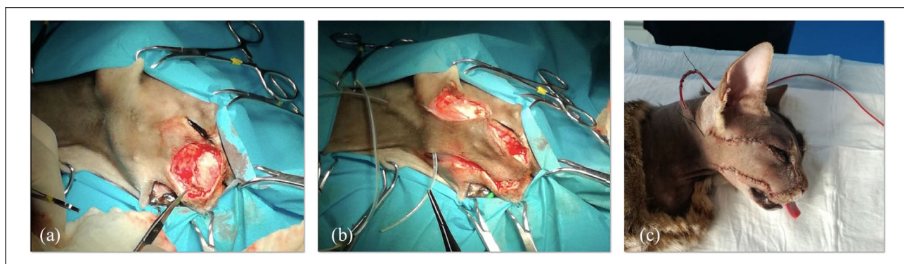
Figure 4 Intraoperative picture. The tumour was (a) excised and (b) a single advancement flap was created to correct the surgical defect. (c) At the end of the procedure, a closed suction drain was positioned before wound closure