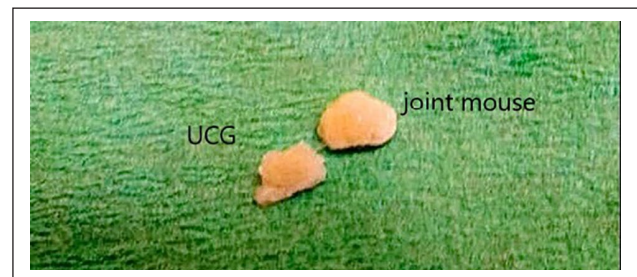
Figure 5 Ununited caudal glenoid with joint mouse attached, after resection and removal

In dogs, UCG can be seen on plain radiography. Only a presumptive diagnosis can be made on the basis of clinical examination and radiographic screening, as UCG can be an incidental finding. 3 Other possible causes of lameness should be excluded and further diagnostics should be made to diagnose UCG as the cause of lameness. Further diagnostics that have been described in dogs are nuclear scintigraphy, arthrography or arthroscopy. 1