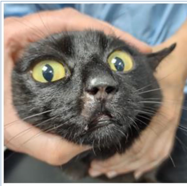
Figure 4 Six months after electrochemotherapy treatment. There is a local area of alopecia and mild thickening of skin at the site

In humans, the incidence of melanoma has been increasing over the last 50 years. Despite accounting for <5% of cutaneous human malignancies, they are the leading cause of human skin cancer deaths, owing to their propensity for metastasis. 3,4 ECT is an effective treatment for cutaneous metastasis of melanoma in humans, resulting in a tumour response (complete or partial response) in 74% of over 2000 tumours in