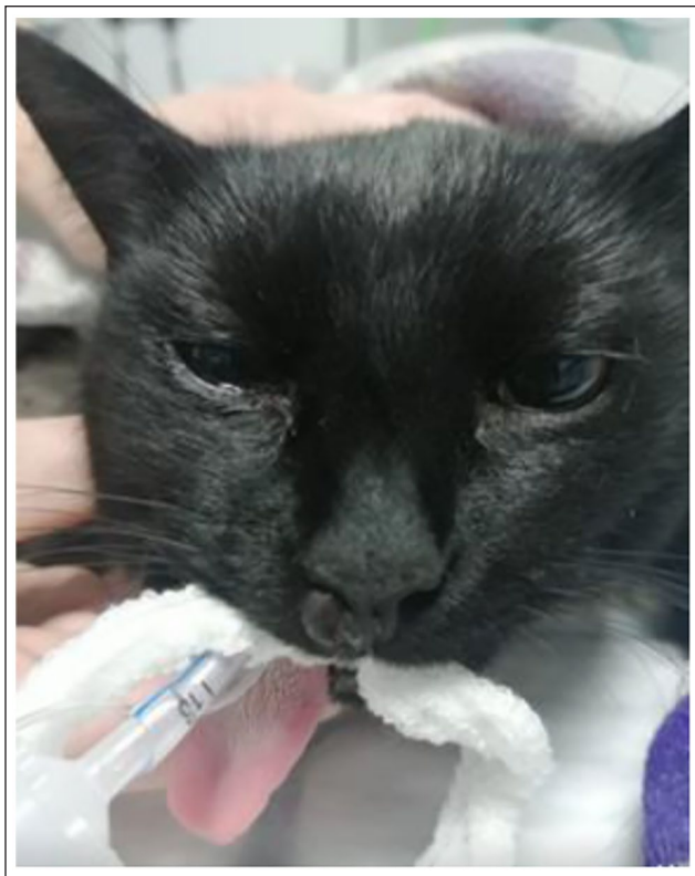
Figure 1 Mass prior to initial treatment; it was 7 mm in diameter and affected the right side of the nose, just distal to the plenum

Bleomycin was injected intravenously as a bolus at a dose of 20 mg/m 2 . Pulses were generated using an electroporator certified for veterinary use (Onkodisruptor). Contact between the patients and the electrodes (M1 clamp electrodes; Onkodisruptor) was optimised using an electroconductive gel. Five minutes after the chemotherapy injections, the sequences of eight biphasic pulses (two phases of 50 µs given in each pulse of electricity) were delivered in bursts of 1200 V/cm.