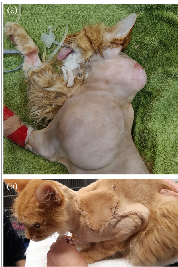
Figure 1 Gross appearance of the cutaneous xanthomas (a) preoperatively and (b) 2 weeks postoperatively

A board-certified internist experienced in ultrasonography performed ultrasounds of the abdomen and masses. The liver and spleen were normal in size, shape and echogenicity. The gallbladder was moderately distended, without distension of the common bile duct, and contained small amounts of gravity-dependent sediment. The kidneys were normal in size (left 4.6 cm and right 3.9 cm in length) and shape. The adrenal glands were normal in size (left 0.45 cm and right 0.42 cm at their respective caudal poles) and shape. The pancreas was mildly thickened (body 12.1 mm and pancreatic duct 2.0 mm in width), consistent with historical or chronic pancreatitis. The gastrointestinal tract was normal in thickness and layering. The jejunal and ileocolic lymph nodes were of normal size but were mildly hypoechoic and prominent. There was no abdominal free fluid. The cranial thoracic mass contained hypoechoic and thickened tissue consistent with cellulitis and oedema. Fine-needle aspiration (FNA) with a 22 G needle was non-productive. The dorsal cervical mass contained echogenic material. FNA yielded 60 ml of blood-tinged