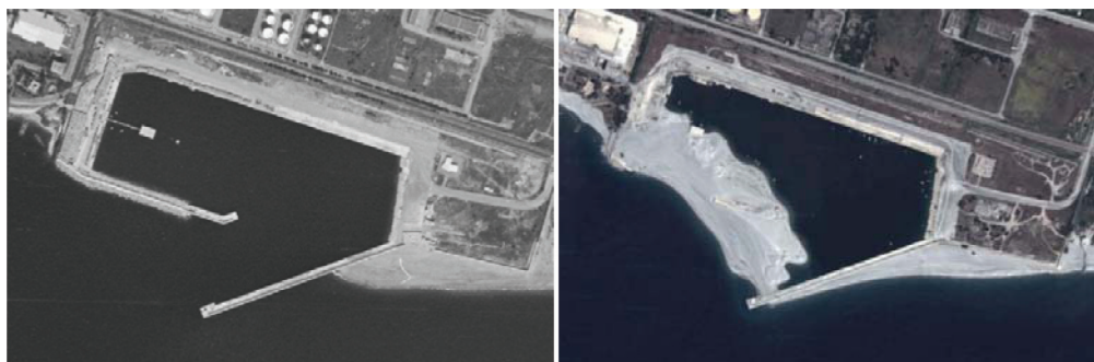
Figure 1. Aerial view of the Saline Joniche Port in 1984 and in 2013.

LST, set-up and wave run-up are the principal causes of coastal erosion and coastal flooding. The physical description and quantification of these phenomena are frequently carried out by means of simplified models. 3–8 Many times, all natural processes are influenced by urbanization which, through the construction of coastal structures, affects the natural evolution of the shoreline. 9 In these cases, it is important that a deep knowledge and investigation of the interaction between wave and structure is established in order to avoid the failure of an intervention. 10–14