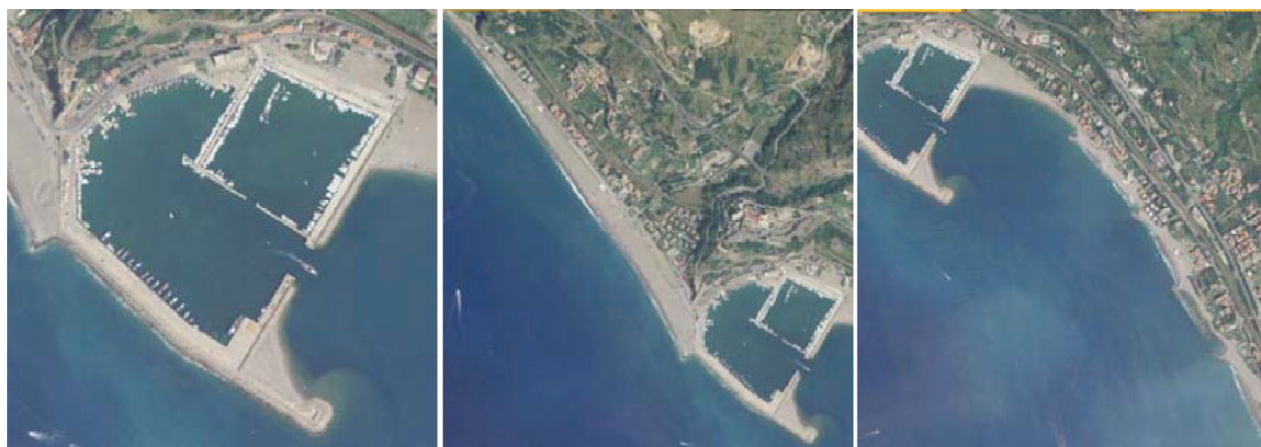
Figure 4. Aerial view of the actual situation of Cetraro Port, of the northwest side and of the southeast side.