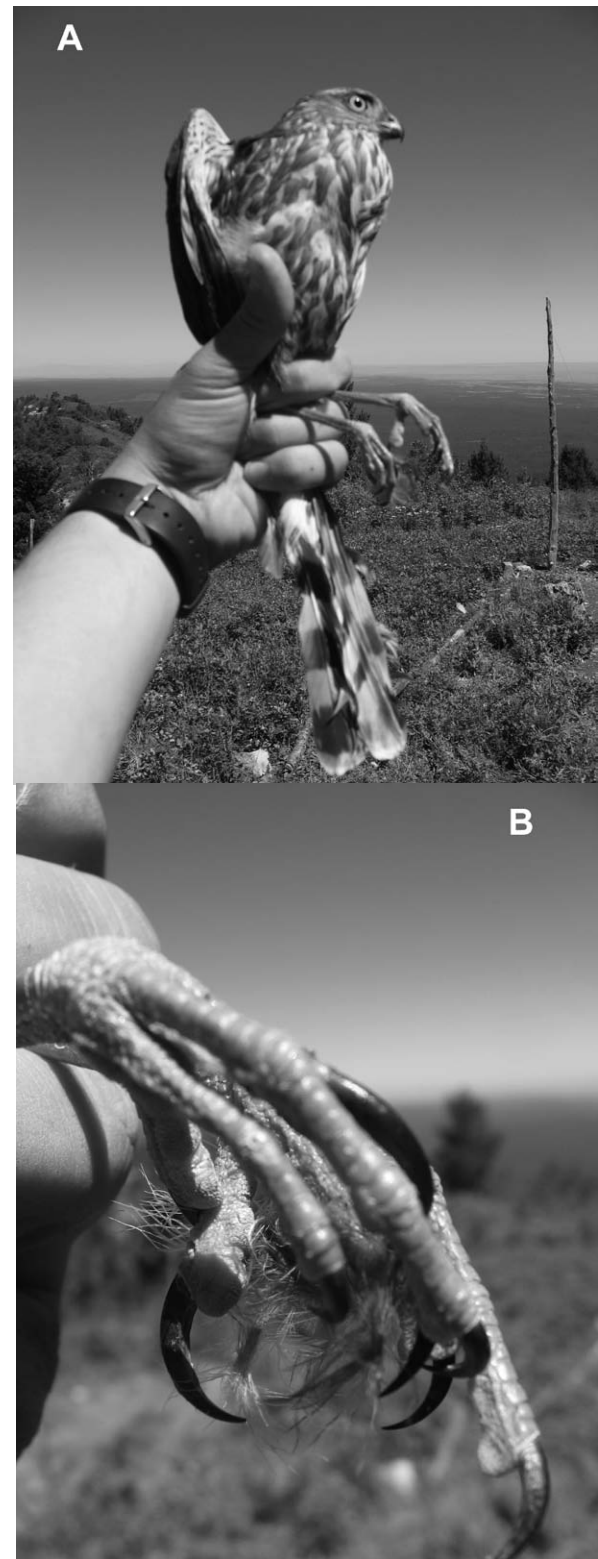
FIGURE 1. (A) A hatch-year Sharp-shinned Hawk captured at Capilla Peak in the Manzano Mountains, New Mexico, with distended crop, indicating recent prey capture and consumption. (B) Close-up of feet of the same bird, showing feathers of prey stuck to toes and talons.

Other researchers sampled potential avian prey in the area at two sites, one near the raptor-banding site at Capilla Peak (DeLong et al. 2005) and the other 35 km north of Capilla Peak in the foothills of the Manzanita Mountains near Coyote Springs. The mist-netting site at Capilla Peak was ~1 km from the primary raptor-banding site along the same ridge complex used by migrating raptors. Migrating raptors frequently passed through the netting area, hunted in the vicinity, and were occasionally captured in the mist nets. The Coyote Springs mist-netting site was in the same mountain range as Capilla Peak, with raptors known to pass through the area before arriving at Capilla Peak. Thus prey sampled