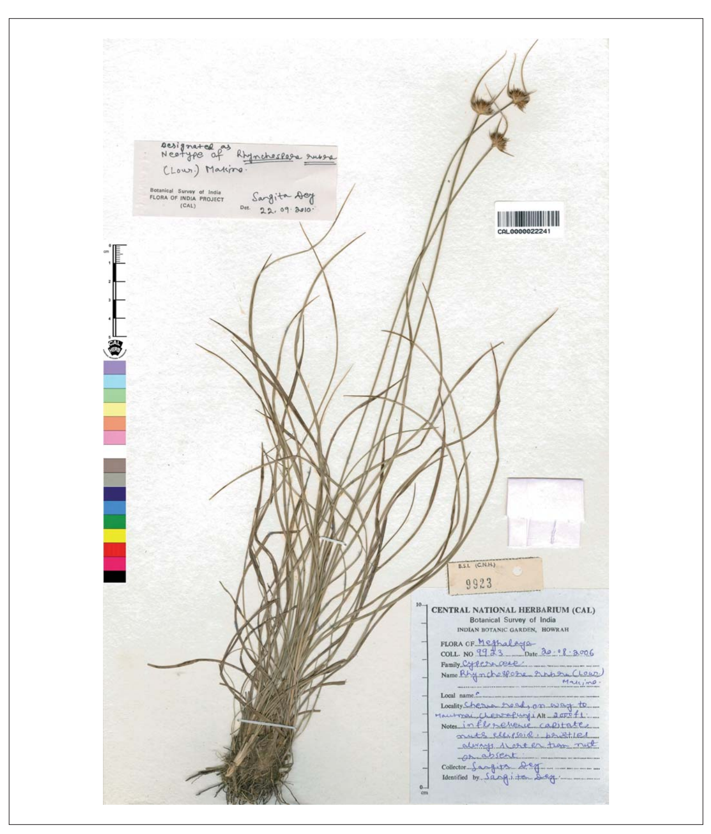
Fig. 3. – Neotypus of Rhynchospora rubra (Lour.) Makino. [Sangita Dey 9923, CAL]