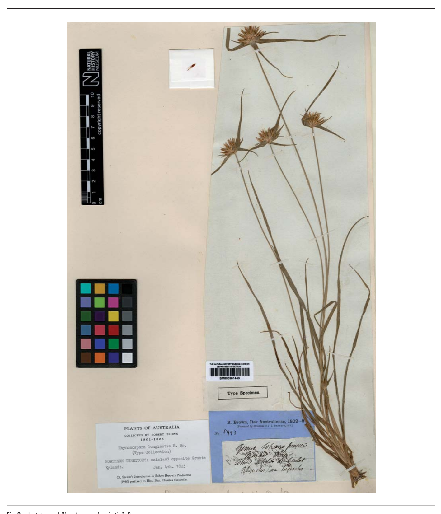
Fig. 2. – Lectotypus of Rhynchospora longisetis R. Br. [ Banks s.n., BM ]