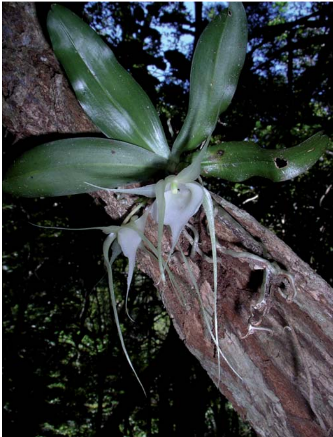
Fig. 4. – Flowering type collection of Aeranthes unciformis P. J. Cribb & Nusb. [L. Nusbaumer & P. Ranirison 1168]

The most frequent species recorded together with Aeranthes unciformis are: Dracaena xiphophylla Baker, Euonymus pleurostylioides (Loes.) H. Perrier, Diospyros pruinosa Hiern and Acalypha aff. perrierii Leandri.