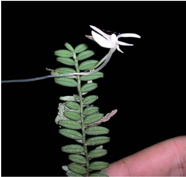
Fig. 2. – Flowering shoot of the type collection of Angraecum darainense P. J. Cribb & Nusb.

[L. Nusbaumer & P. Ranirison 1430]