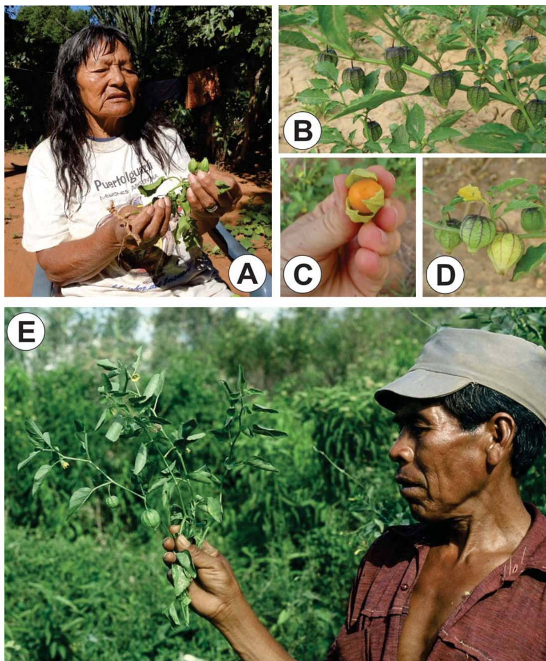
Fig. 2. - Physalis viscosa L. A. A Maká Indian offers information about the plant; C. Ripe fruit with remains of the accrescent calyx; E. A Choroti Indian shows a branch of the plant. Physalis angulata L.; B, D. Branch with fruit.