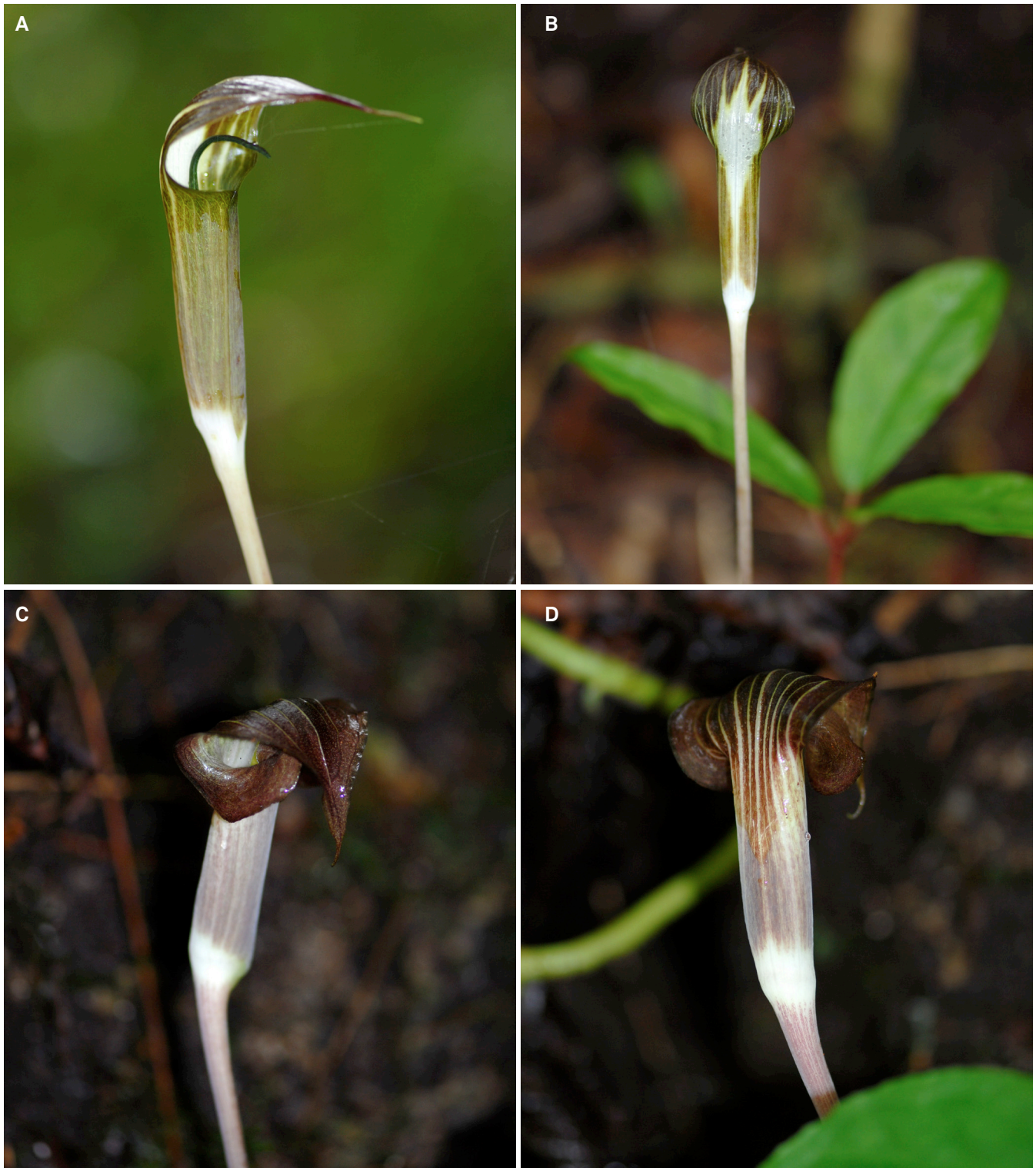
Fig. 2. – Inflorescences of Arisaema brinchangense Y.W. Low, Scherberich & Gusman ( A-B ) and A. anomalum Hemsl. ( C-D ). A. Side view of the inflorescence showing straight and hardly recurved spathe-tube mouth margin; B. Dorsal view of the inflorescence showing distinct white to pale cream coloured trident marking (with three pointed tips) on the spathe-limb; C. Side view of an inflorescence showing strongly recurved (auriculate) spathe-tube mouth margin; D. Dorsal view of the inflorescence showing white to pale cream coloured narrow parallel stripes along the spathe-limb.