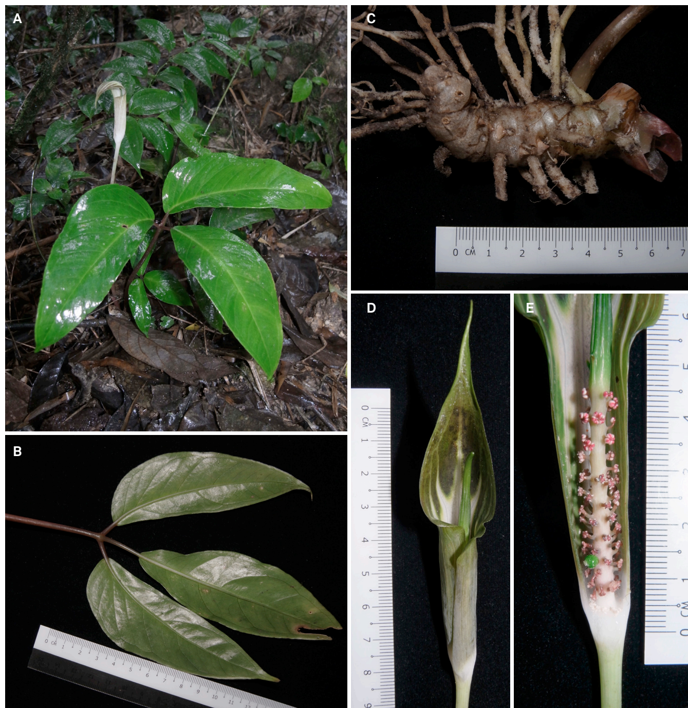
Fig. 1. – Arisaema brinchangense Y.W. Low, Scherberich & Gusman. A. Habit; B. Details of the lower leaf blade surface; C. Rhizome showing numerous offsets and fleshy white roots, inflorescence artificially removed; D. Front view of an inflorescence showing spathe-limb with distinctive white trident marking (with three pointed tips) and spadix-appendix slight bent forward; E. Spathe-tube of a male inflorescence artificially removed to show the male spadix fertile zone, note pollen accumulated at the base of the tube. [Low & Low-Edwin LYW 520, SING]