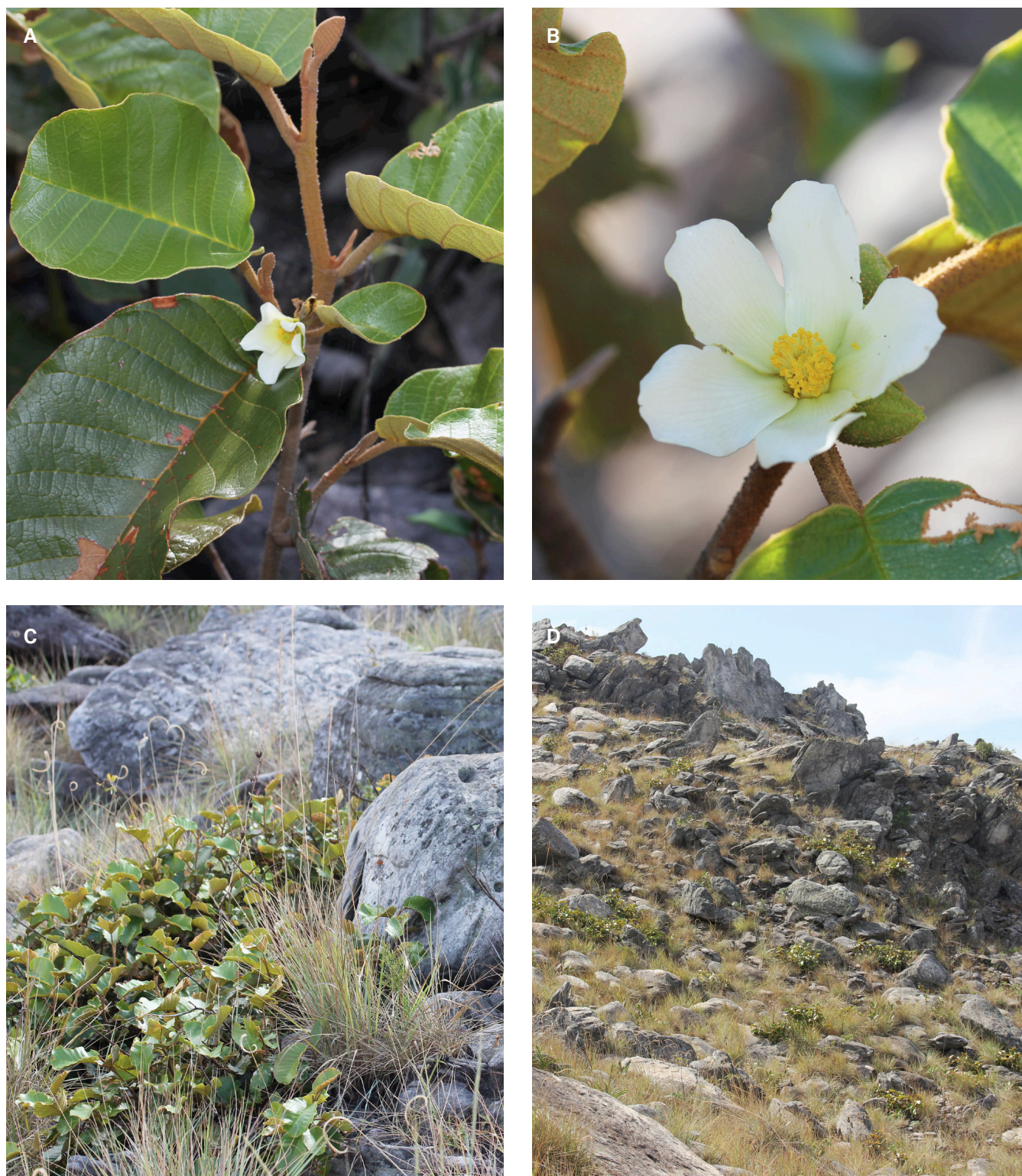
Fig. 2. – Photographs of Pentachlaena vestita Andriam., Lowry & G.E. Schatz. A. Flowering branch; B. Close-up of flower (note dense indument on lower surface of leaf); C. Adult plant; D. Habitat of type locality, with open wooded grassland and bushland/Tapia woodland and rocky quartzite substrate.