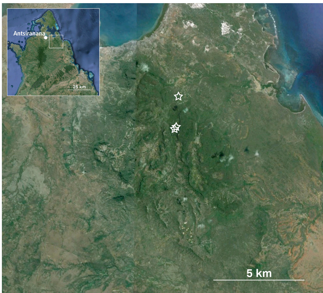
Fig. 4. – Distribution of known collections of Croton aleuritoides P.E. Berry from northern Madagascar, in the Montagne des Français massif (stars).