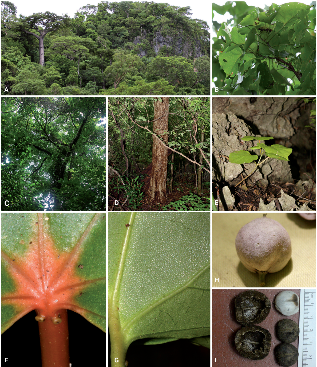
Fig. 3. – Croton aleuritoides P.E. Berry. A. Typical habitat in Montagne des Français, deciduous forest on limestone “tsingy”; B. Canopy leaves; C. Canopy from below; D. Trunk (c. 40 cm in diam.); E. Seedling growing in a crack of a block of limestone tsingy; F. Close-up of the adaxial side of a leaf base showing the epipetiole glands and the distinct reddish coloration at the junction of the secondary veins; G. Close-up of the abaxial leaf surface showing the minute lepidote pubescence; H. Fruit, already fallen to the ground and still indehiscent; I. Endocarps and seeds; note the white fleshy cover of the fresh seed on the upper right.