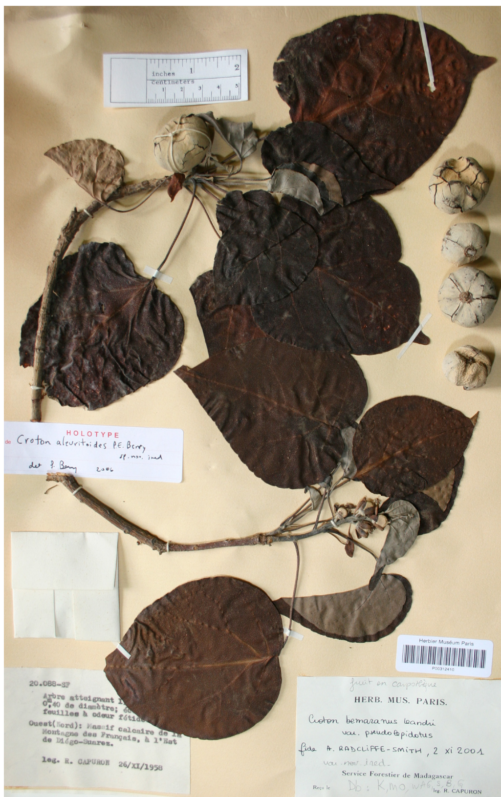
Fig. 1. – Holotype of Croton aleuritoides P.E. Berry.

[Service Forestier 20088, P]