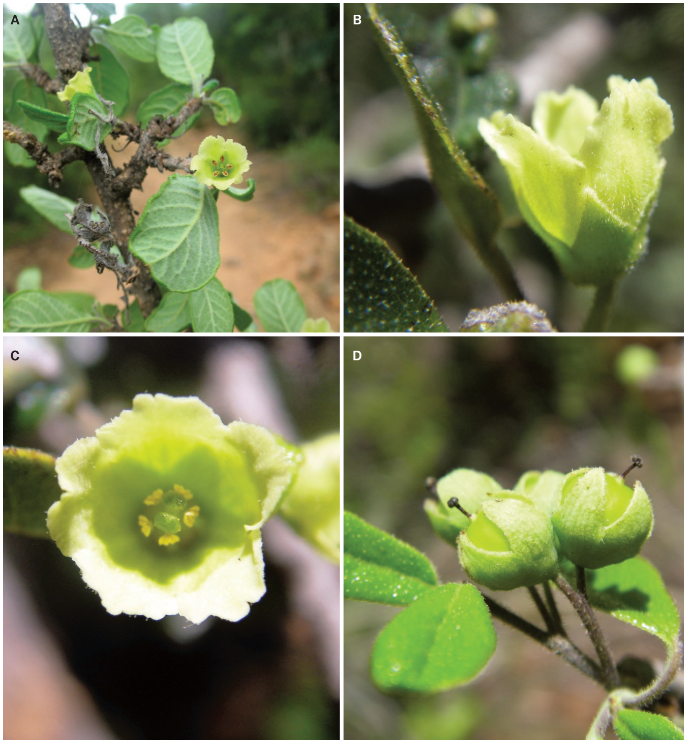
Fig. 1. – Bourreria scabra Thulin & Razafim. A. Flowering branch; B. Flower; C. Inside of flower, showing anthers and tip of style; D. Fruits. [A: Ravelonarivo 4630; B, C: Ratovoson 1592; D: Ratovoson 1508]