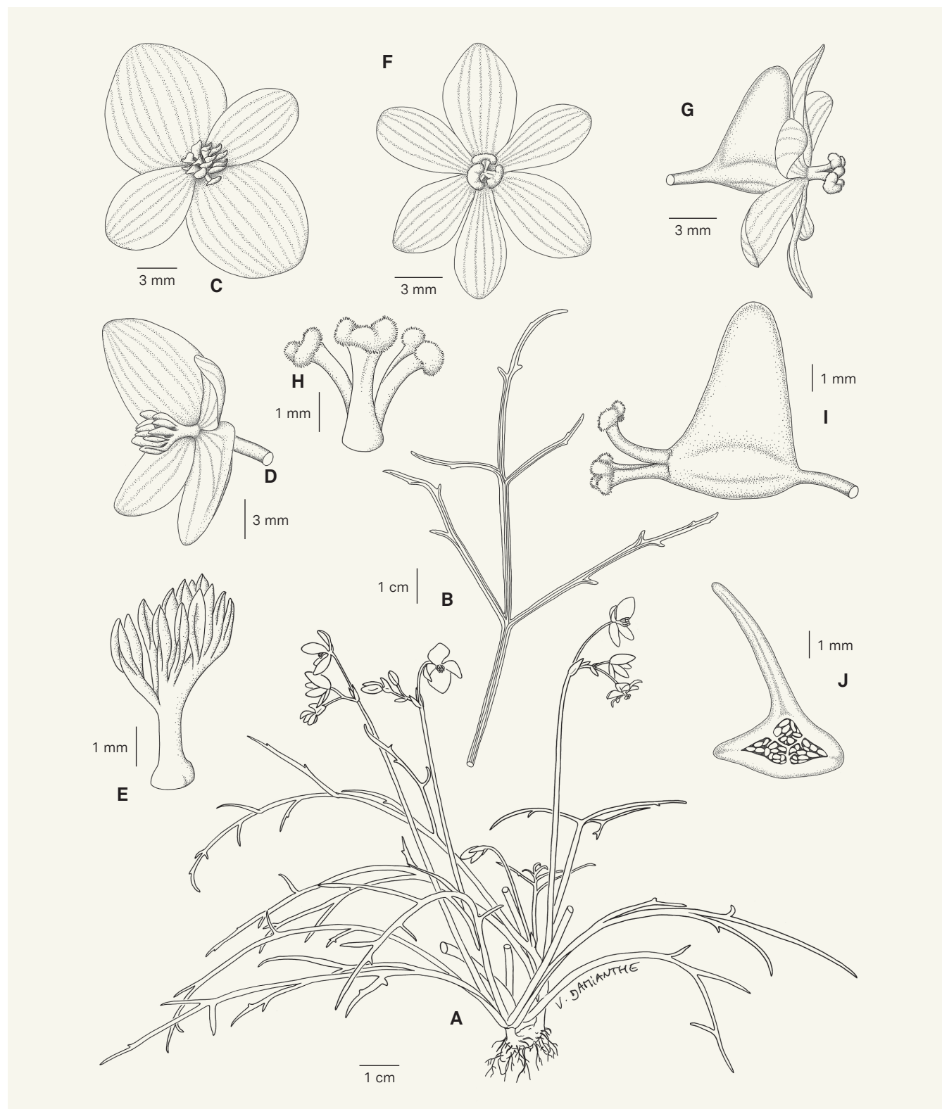
Fig. 2. – Begonia pteridoides Scherber. & Duruiss. A. Habit; B. Leaf, adaxial side; C. Male flower, front view; D. Male flower, side view; E. Androecium; F. Female flower, face view; G. Female flower, side view; H. Styles and stigmas; I. Ovary; J. Ovary cross-section. [Scherberich 1148, LYJB] [Drawing: Vanessa Damianthe]